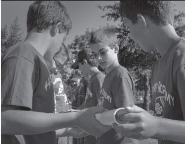
Youth involved in activities at the 2009 Gateway Academy camp in Prairie du Chien