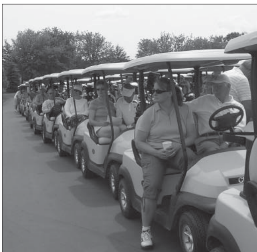
Golfers are ready to take off at the 2nd Annual Northern Golf Classic