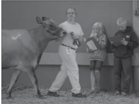
4-H youth participate in 2009 Area Animal Science Days