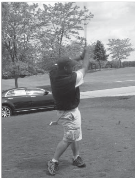
A golfer tees off at the 7th Annual Southern Golf Classic

The Golf Classic was presented by event sponsors Kenosha Beef International of Kenosha and We Energies of Milwaukee . LeRoy C. Haueser & Co. S.C. Rural Insurance of Cedarburg and the Wisconsin Farm Report of Madison were also major sponsors.