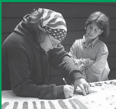
4-H Arts programs are popular with youth of all ages.