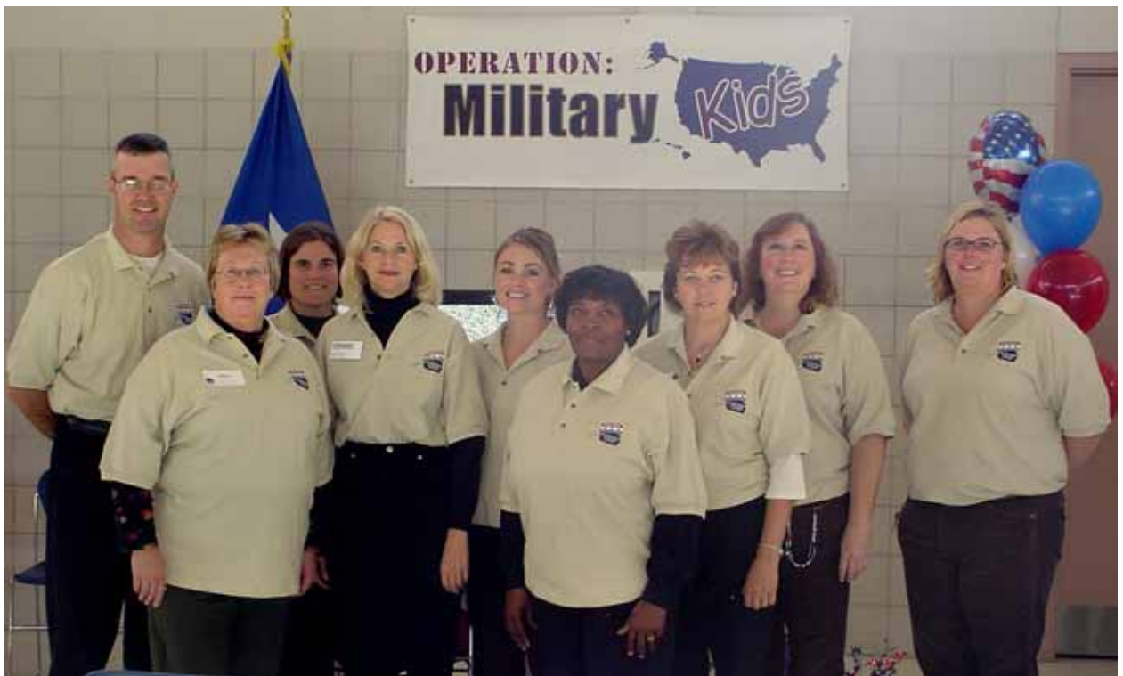
Wisconsin OMK Team at the Kickoff Event on October 27