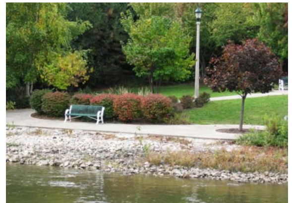
Beautiful, but small public space along river

What have you seen that could be developed into a tourist attraction (natural or man-made)?