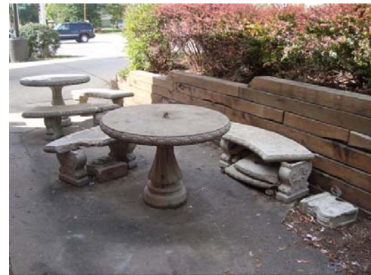
Poorly maintained patio