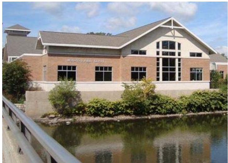
Beautiful library that is highly visible in the downtown