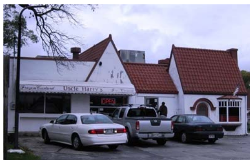
Destination frozen custard

Rate and comment on the overall condition of the retail sector