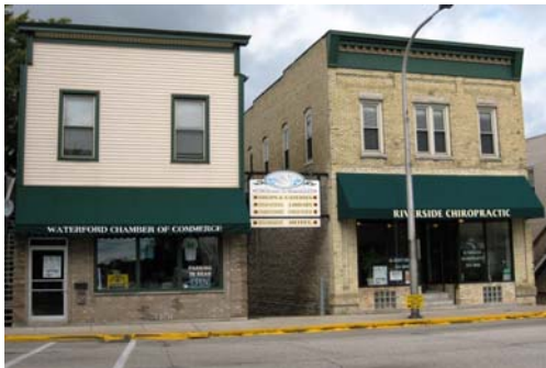
Directional signage suspended between buildings