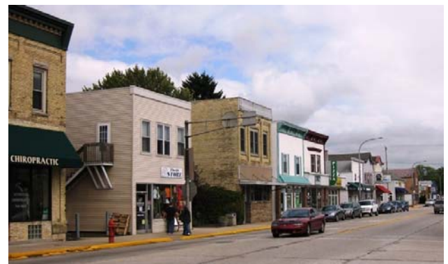
Downtown retail district

Average Team Score: 5.5 Range of Scores: 4 to 8 (6 responses)