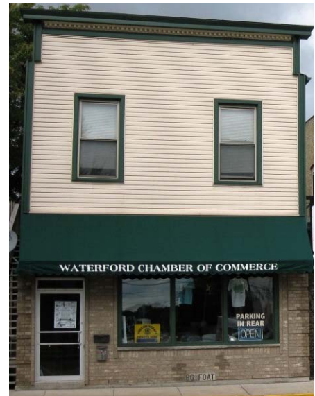
Highly visible Chamber of Commerce located in the downtown

Were there any government or nonprofit organization activities that are serving as traffic generators for the downtown (city hall, post office, YMCA)?