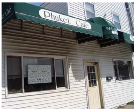
Attractive awning, but dirty siding and confusing signage- café or dog grooming?