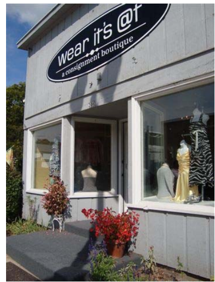
Attractive window display