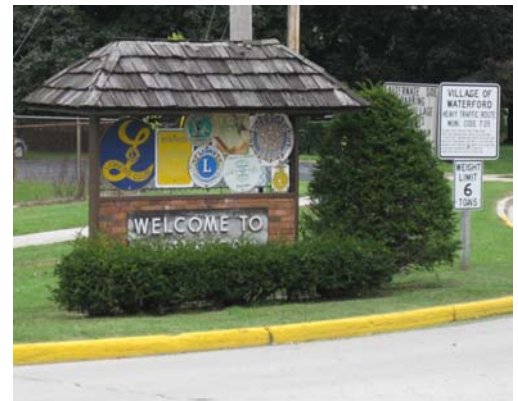
Example of an older community entrance sign & overgrown shrubs