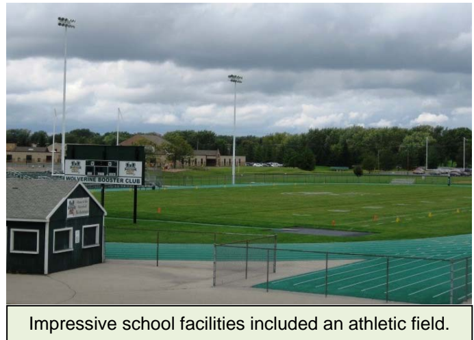
Impressive school facilities included an athletic field.