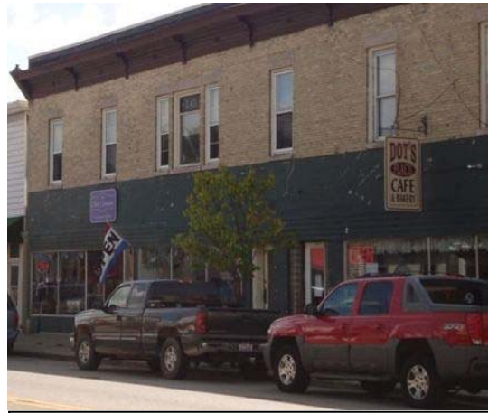
Example of a façade in need of painting