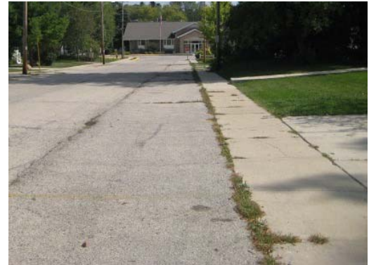
No curb between sidewalk and street