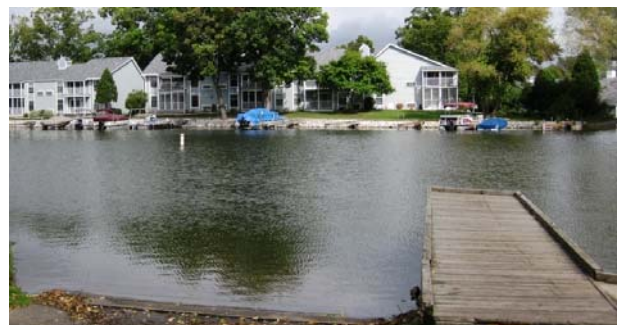
View from the boat launch