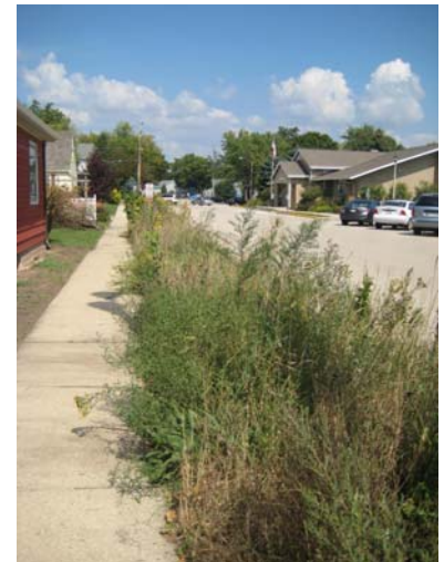
Endangered prairie flower area could use additional signage- looks like overgrown weeds