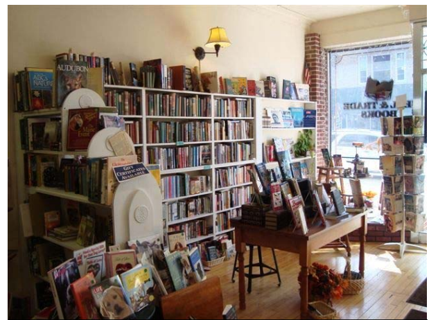
Appealing bookstore with knowledgeable staff