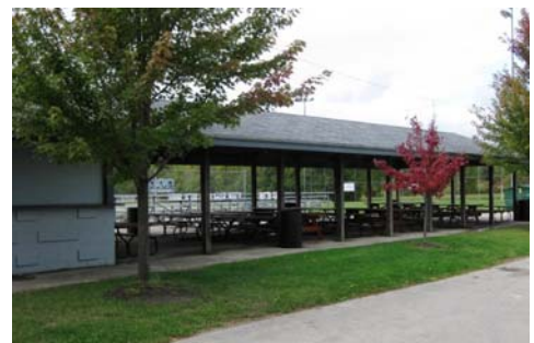
Picnic shelter & concession stand