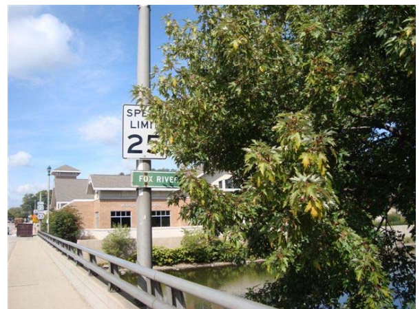
Overgrown trees blocking signage