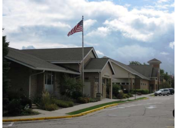
Attractive village hall and library

How would you rate the availability and quality of the following information provided by the municipal government?