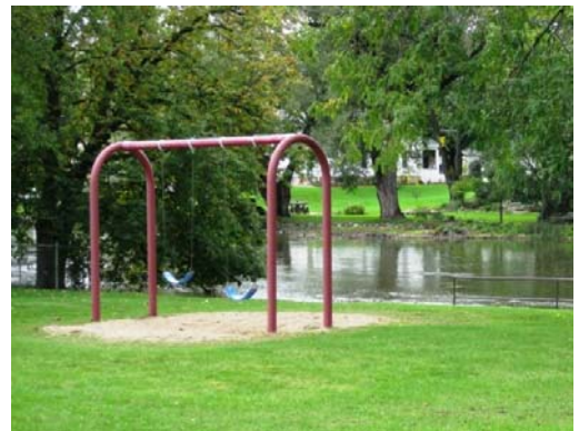
Lack of playground equipment