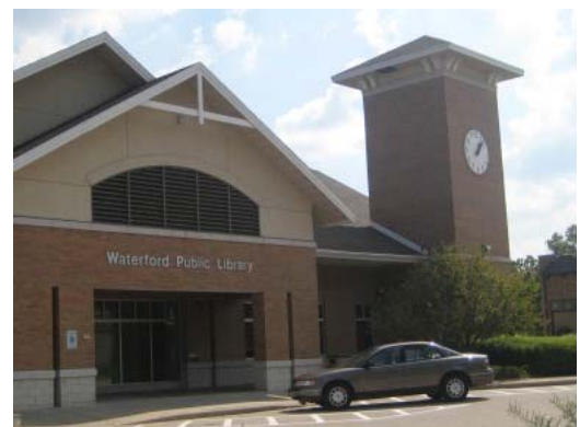
Wonderful library located in the downtown