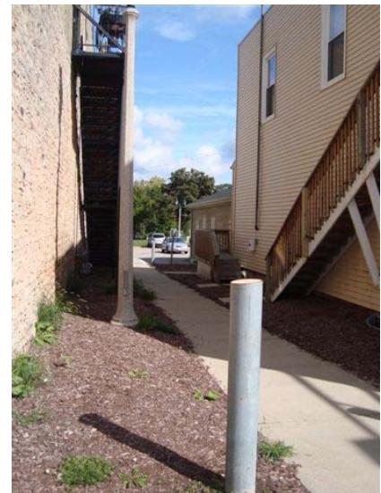
Weeds growing in landscaping

Rate and comment on the quality (appearance, adequacy, etc.) of lighting in the downtown.