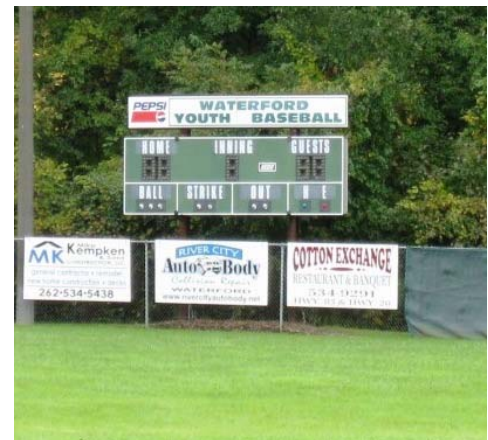
Impressive baseball facilities