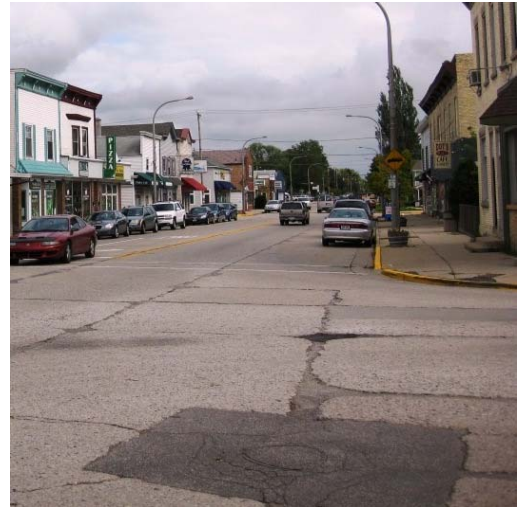
Uneven pavement in crosswalk due to cracks and asphalt repairs

Are community facilities and infrastructure generally accessible for people with disabilities?