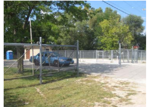
Uninviting entrance to baseball fields