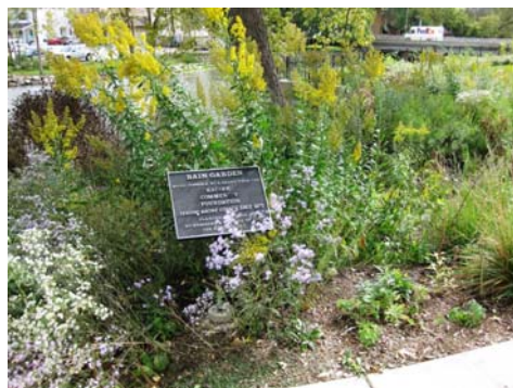
Beautiful rain garden along river outside library and village hall