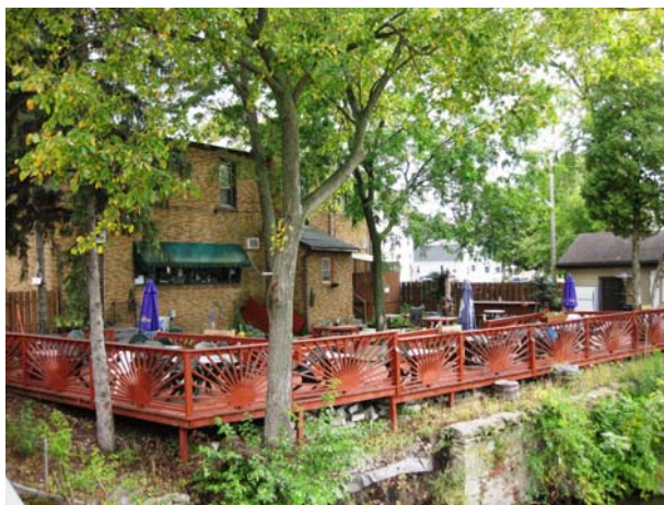
Very inviting patio adjacent to river