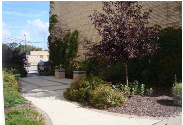
Downtown parking available behind buildings and connected to Main Street with attractive walkway and landscaping

Comment on the mix of facilities and services in the downtown (housing, professional services, retail, recreation, accommodation and food, industry, parks, etc.).