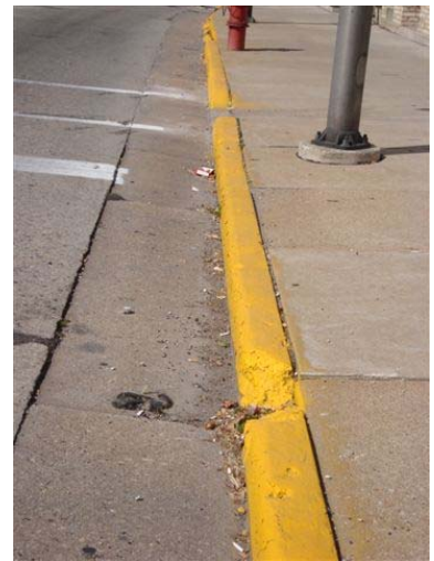
Debris in streets