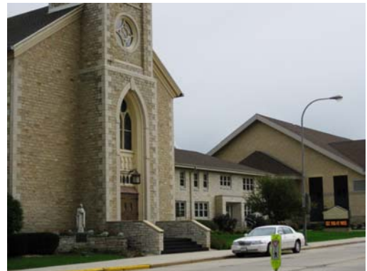
Impressive church campus

What recreational activities or facilities seemed to be missing?