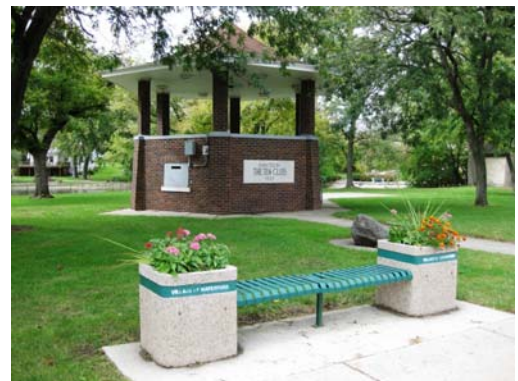
Small park with attractive bench & plantings