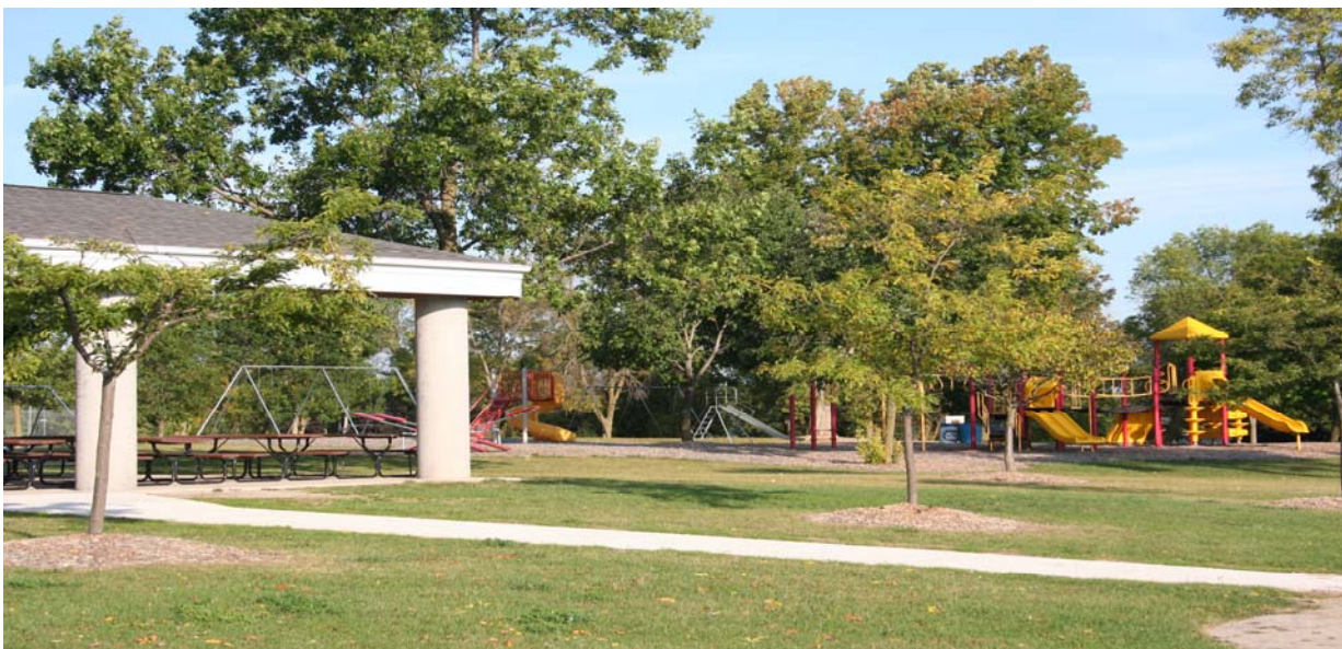
First Impression Visit to Seymour

As for the negatives, only a few and these were noted in the downtown area. The downtown sidewalks contained a fair amount of weeds. And although everyone loved the flowers planted in Nagel Park, we thought the planting containers, which appeared to be trash