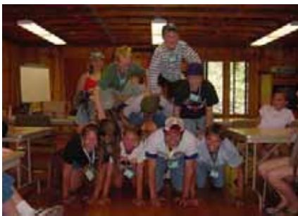
4-H youth at 2003 Tri-County Camp.

Grote, Ashland County, as camp counselors and area directors. Seventeen Ashland County youth attended Tri-County Camp as campers, including 3 youth from the After-School 4-H Program.