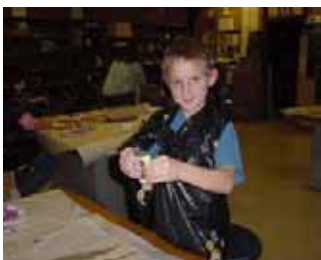
Art Club is extremely popular and the youth enjoy the time after school.

"After-School Programs have been extremely popular with the younger crowd."