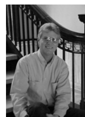
UW-Ashland Agricultural Research Station, 68760 State Farm Road, Ashland, WI 54806 Phone: 682-7268 Fax: 682-7269