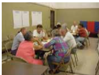
The Town of LaPointe: one of four 2003 Visioning Sessions.

'think tank type' planning that reaches far into the future. This