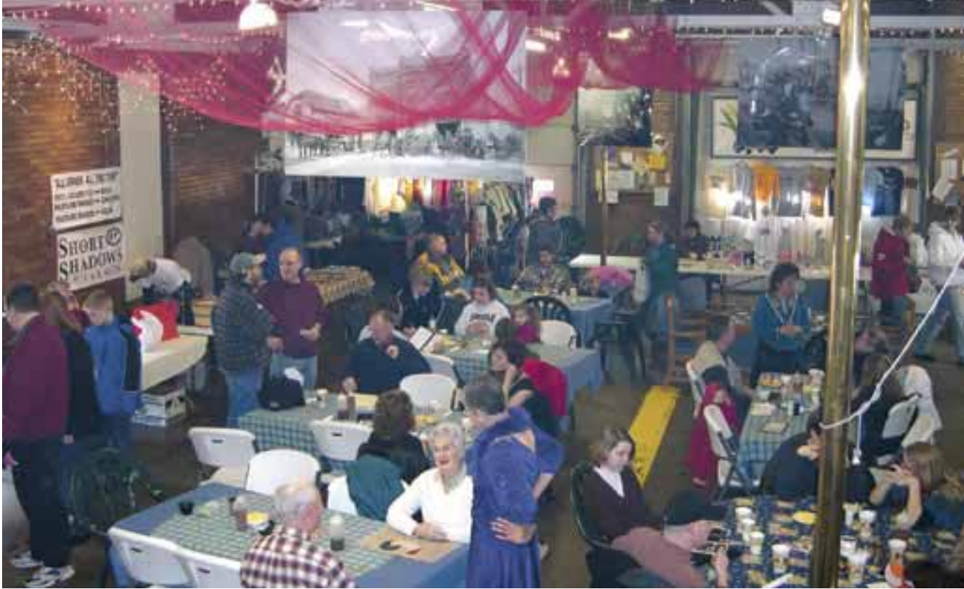
Woodbury County residents enjoy fresh food and good company at Fiona's Firehouse Bistro, a restaurant that serves locally grown vegetables, meat, and fruit.