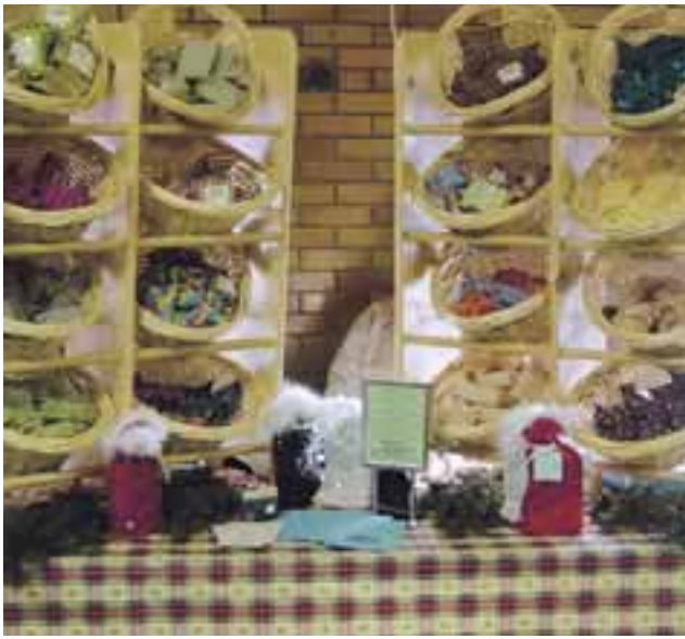
Locally produced soaps are sold at the new Floyd Boulevard Local Foods Market.

most recent effort to improve infrastructure for local organic growers, the Chamber of Commerce, the City of Sioux City (county seat), and Woodbury County are taking steps to market an existing 280,000 sq.ft. cold storage/packaging/distribution facility as a major initiative to develop the entire region into the “midwest center of the organic food industry”.