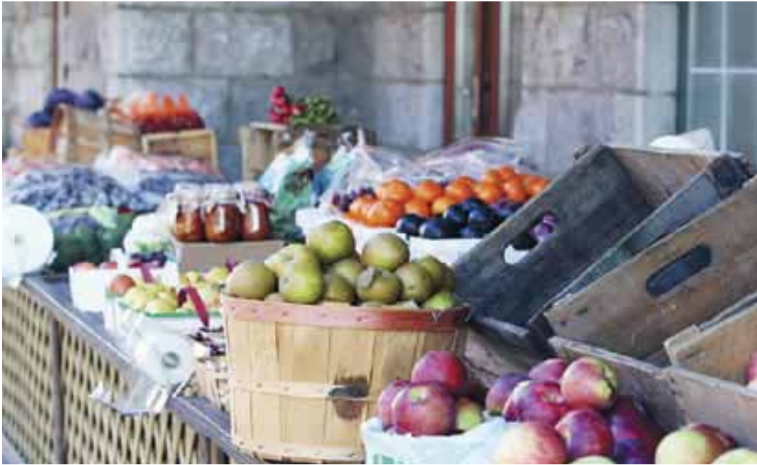
Promoting farmers markets is one action food councils can take to increase the availability of fresh foods in communities.

Locally grown food is central to the County's history, culture, landscape, economy and health.