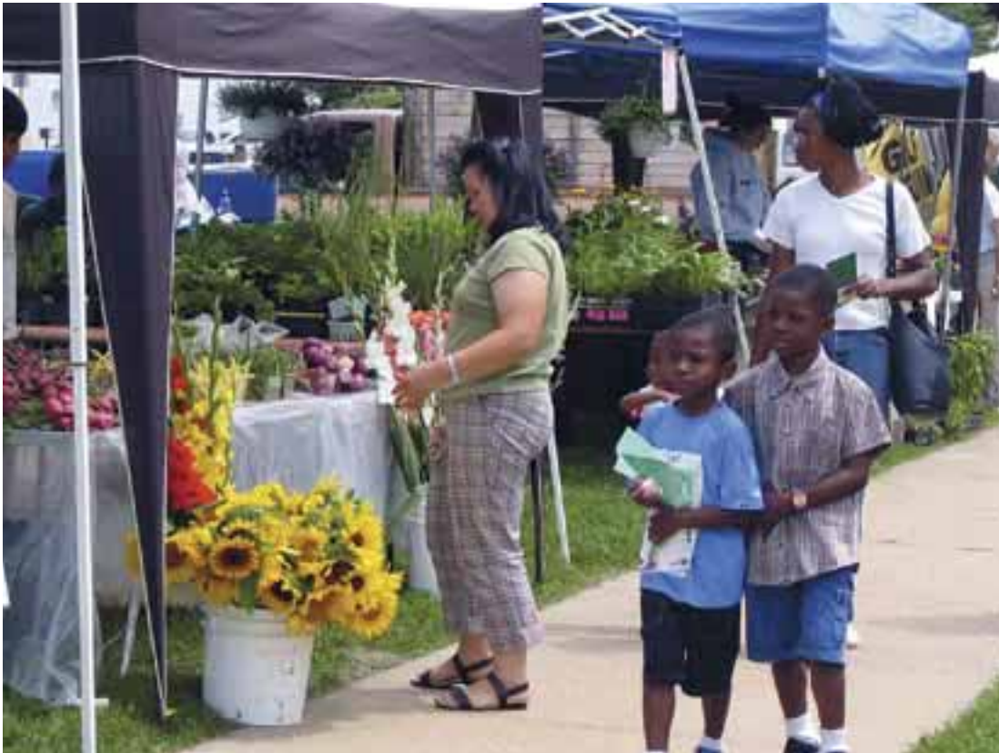
Dane County residents shop at the Southside Farmers Market.

By sourcing directly from farmers and eliminating the middle man, the Market Basket program is contributing to greater food security and a more balanced diet, while at the same time creating a reliable market for small-scale farmers.