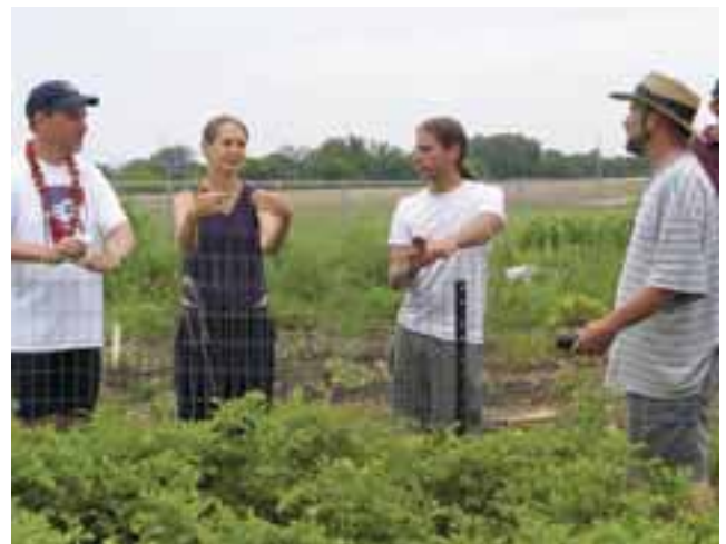
The mayor of Madison, WI speaks with local farmers about issues affecting agricultural production.