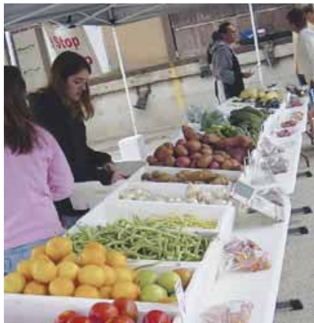
Woodbury County growers sell fruits and vegetables at the newly created Sioux City Organic Farmer’s Market.

To help create that infrastructure the County supported the creation and expansion of a local food store via political support and by purchasing food from the store through the County food service contractor. The Board worked with a coalition of stakeholders to fund the renovation of the commercial grade kitchen, giving $20,000 of the $100,000 project. Currently, the Chamber of Commerce is taking steps to establish a working relationship with Jacobson-Bekin, the owner of the cold storage facility that the County would like to see made available to organic producers.