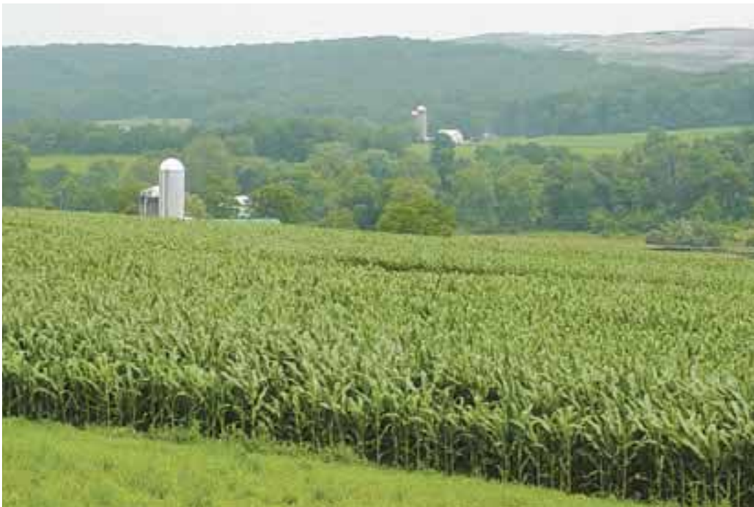
Conserved farmland in Lancaster County.

By putting aside 69,000+ acres of land for the sole purpose of farming, Lancaster County has created stability and assurance that agriculture will remain as a mainstay in the local economy.