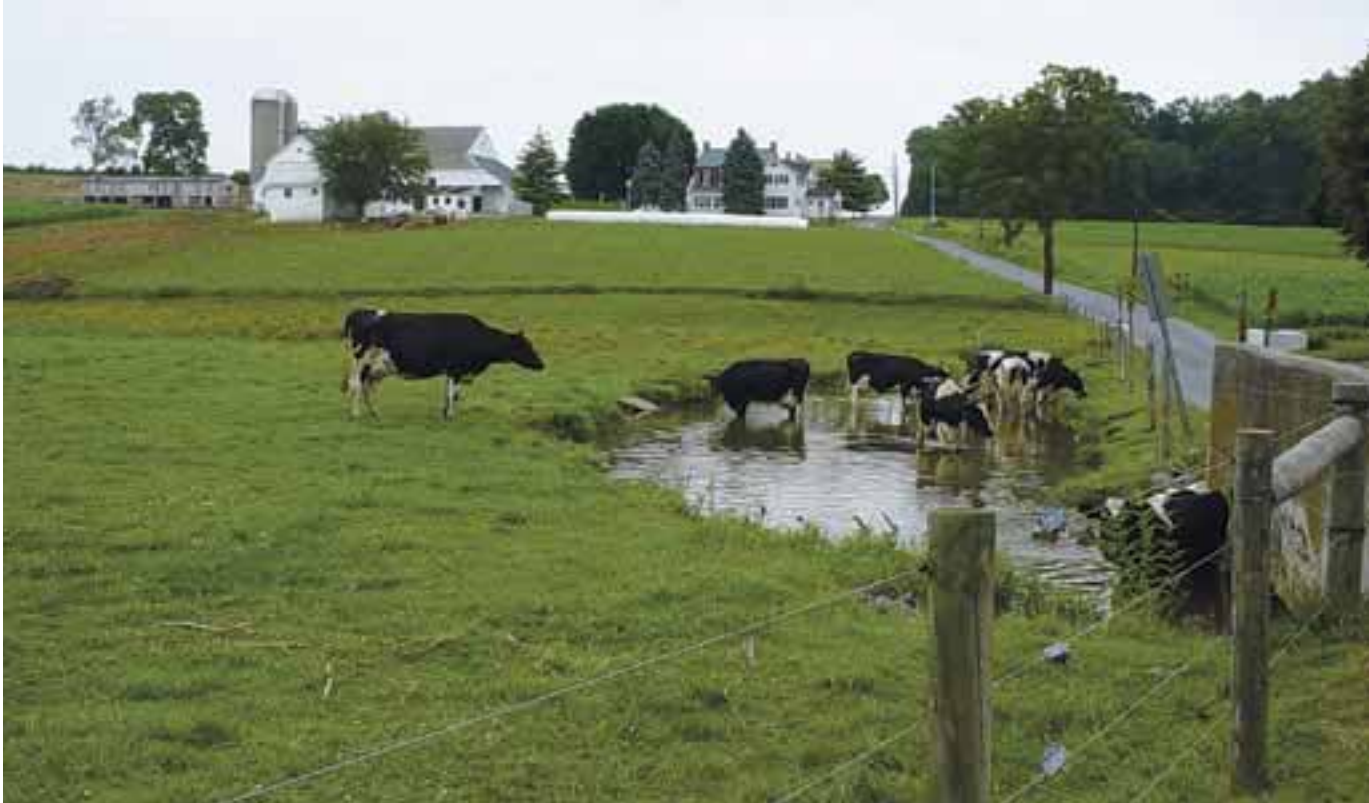
Agricultural conservation easement programs ensure that farms like these will remain available for food production for generations to come.