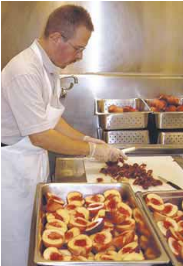
A Missoula Public Schools employee prepares locally grown peaches to serve with students' lunch.

A farm to school program exists when a K-12 school district or school purchases fruit, vegetables and other fresh products from local farms to serve as part of school meals and/or snacks. There is often an education component in which students learn about nutrition and the food supply. Education varies by program, but it is common for students to take trips to local farms and taste test and learn about topics such as animal husbandry, soil fertility and harvesting. It is also common for students to participate in school gardens, learning how to grow their own food and how this ties in with science, math and other subjects. Older students often participate in nutrient mapping exercises and some schools offer cooking classes in which students prepare food using local ingredients. School size and capacity and involvement of local growers are three important factors that influence the scope of farm to school programs.