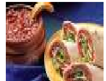
Bean Tacos or Burritos