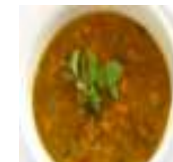
Lentil Soup with Bread