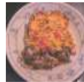
Bean & Cheese Casserole