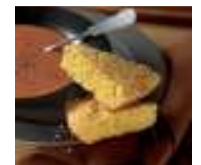
Baked Beans & Corn Bread