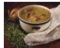
Pea Soup with Milk