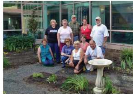
Healing Garden, Hess Memorial Hospital, Mauston