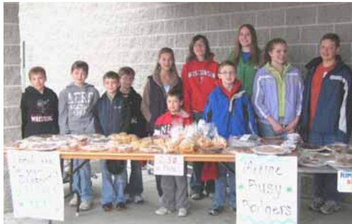
Meeme Busy Badgers members at their bake sale

We want to sincerely thank all those who came out on the rain drenched day for our annual brat fry. We truly appreciate the support. Adopt-A-Highway will be on May 30 th and Breakfast on the Farm is June 14 th . All fair registrations are due at our June 16 th meeting.