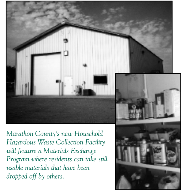
Marathon County's new Household Hazardous Waste Collection Facility will feature a Materials Exchange Program where residents can take still usable materials that have been dropped off by others.

All VSQG participants are responsible for the proper packing and transportation of their waste materials.