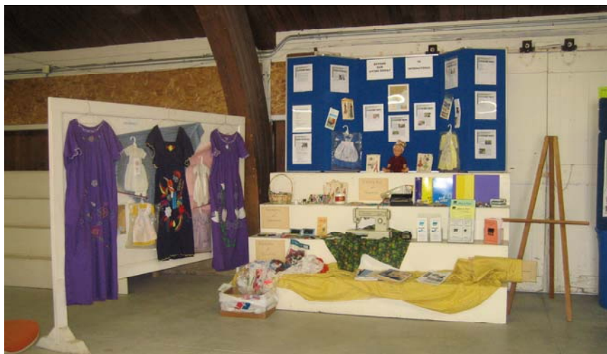
2006 HCE Outagamie Fair Booth

Outagamie County Extension has been a big part of my life. I was a 4-H member and leader, and I am now a HCE member. Our home was designed by Extension staff in Madison, and years later, a barn remodeling and addition was designed by UW-Extension too.