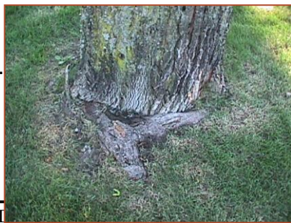
The girdling root is sometimes Seen above ground