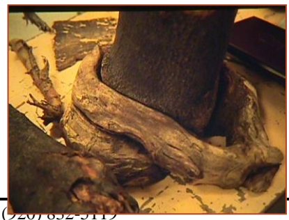
Most of the time the girdling root occurs below ground

UW-Extension, Outagamie County 3365 W Brewster St., Appleton, WI 54914