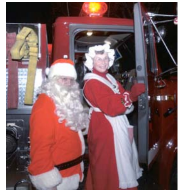
2003 Christmas, Mr. and Mrs. Santa