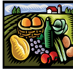
The PriceDirect brochure is a great way to get the word out about your quality products.

Additional information included is a listing of 100 Ways to Eat Sustainably and a list of websites and books for