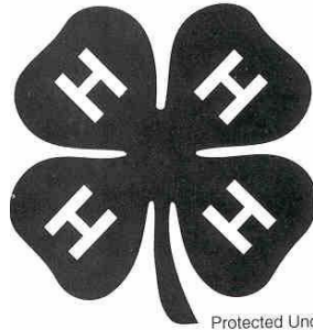
Protected Under 18 U.S.C. 707

All gifts will be acknowledged to the honoree, or family of the memorialized, as appropriate.