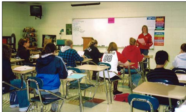
Continued training is a vital part of the 4-H program.