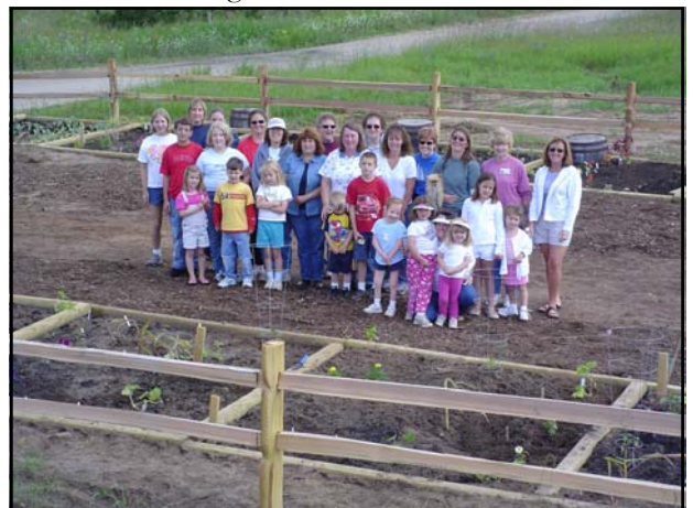
Local UW-Extension Master Gardener Volunteers and Waupaca Children's Garden Participants

In 2006, sixty-one local UW-Extension MG volunteers provided over 6,000 hours of community service and education across the county. That equals three free full-time employees! Examples of their work include: children's gardens in three communities; presentations for organizations on the growing problem of invasive plants; providing local food banks with garden produce, sharing information on how to grow a garden; and helping coordinate displays and judging activities at the Waupaca County Fair.