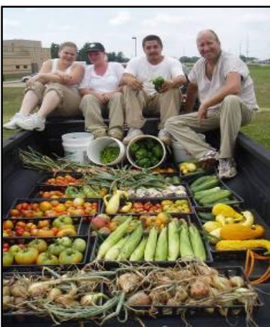
Master Gardeners Help Support Local Food Pantries