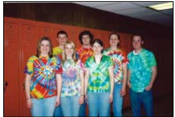
4-H Youth from Sandy Knoll 4-H Club, New London area enjoy their performance.