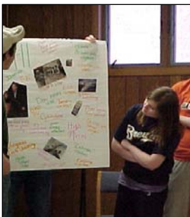
Youth members explain the poster they made about their generation.

Twenty-eight youth and adults from Waupaca and Portage County 4-H attended Teen Winter Camp at Upham Woods 4-H Camp near Wisconsin Dells, February 1 to February 3. Camp went well with emphasis on opportunities to build team work, communication and youth leadership skills. Many of the youth at Winter Camp may be camp counselors or have other leadership roles in 4-H now or in the future. On camp evaluations, 18 of 19 respondents agreed or strongly agreed that through camp activities they learned more about the importance of cooperation and communication. There were also educational sessions about tree identification, outdoor survival, and the Life of a Logger along with time for winter fun like tobogganing and a night hike.