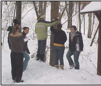
Campers identify trees during one Upham Woods session.