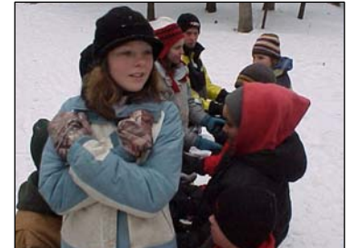
Camper gets ready for a ‘trust fall’, part of the challenge course named Peanut Butter Mountain.