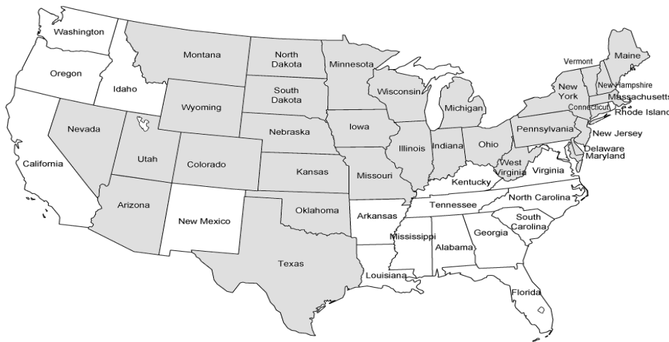
Figure 3: States offering LGM-Dairy (2008)