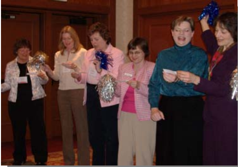
"More team spirit"