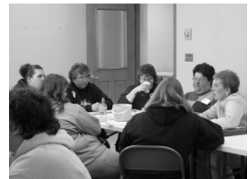
Wilton HOF participants discuss balancing farm, work, family and personal priorities.

Three Annie's Projects were held in 2006-07 as well. (For more information on Annie's Project see page 3.) In 2007, 32 women participated in this