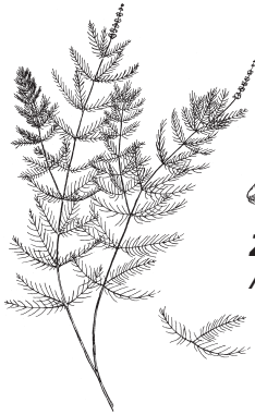
Eurasian Watermilfoil - 12-21 pairs of leaflets