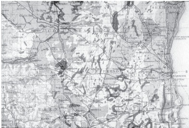
Figure 2. Southeastern portion of Chamberlin (1882) map showing soil delineations.