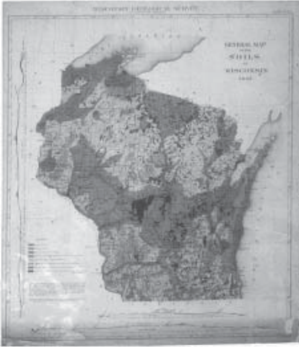
Figure 1. Chamberlin (1882) map of the soils of Wisconsin.

Agricultural considerations, particularly regarding an assessment of the composition and quality of soils of the state, were among the purview of the geological surveys of Wisconsin that preceded the Wisconsin Geological and Natural History Survey. This was not lost on Lapham's colleagues and successors, most notably Thomas Chrowder Chamberlin.