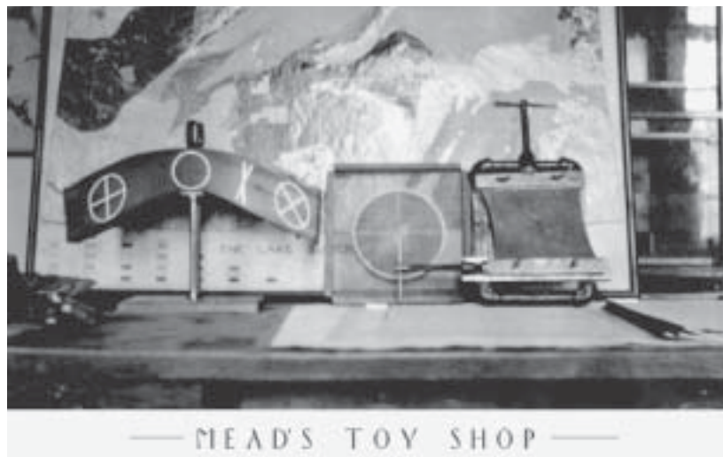
Figure 4. “Mead’s Toy Shop”: Some of the apparatus built by W.J. Mead to illustrate the fundamental mechanics of rock deformation (from Rettger and Emmons, 1921, p. 218).

During mineral explorations in Ontario in the summer of 1902, some student fieldworkers conceived the idea of an annual yearbook or scrapbook named the Outcrop (Deming, 1926). Leith (ca. 1938) reported that it began as a kind of newspaper with a social column and a miscellaneous column concocted to relieve the boredom of rainy, tent-bound days. It soon developed, however, into an ambitious, liberally illustrated record of both the serious and diverting activities of the entire Department of Geology with special emphasis upon summer field work. The Geology Club’s Outcrop was produced by elected student co-editors almost every year from 1902 through 1957. These elaborate volumes, which now reside in the University of Wisconsin Archives, are historical treasure troves of information about the department not to be found in official histories. Especially interesting are letters from alumni about their experiences exploring for minerals or petroleum in far-flung corners of the Earth. Beginning in 1924, a short extract was pub-