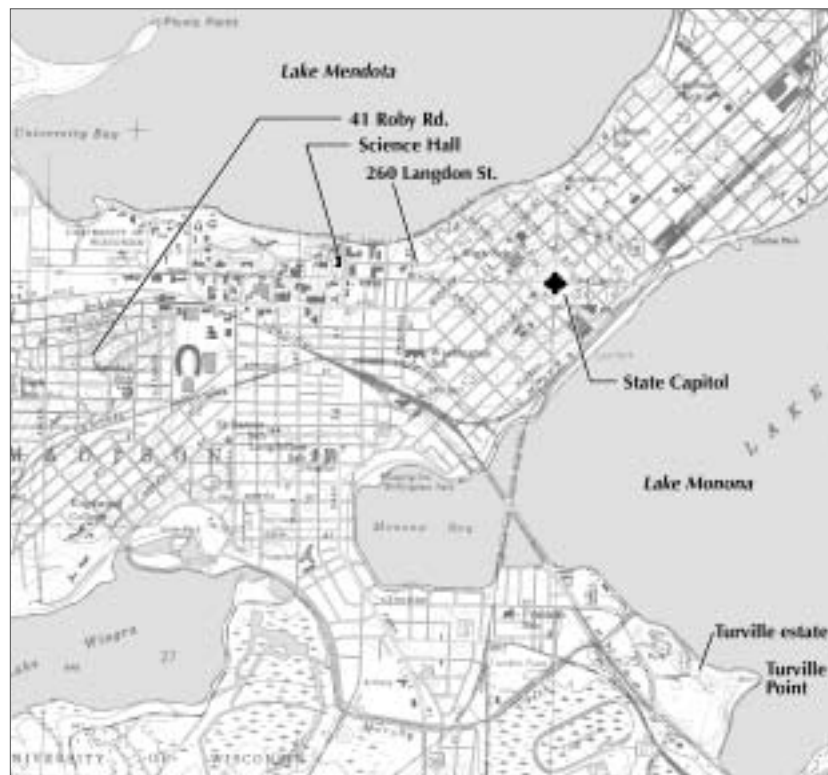
Figure 1. A 1959 map of Madison showing Thwaites' workplace and homes. The Turville estate is shown in the lower right corner of the map; a more detailed map of the farm is shown in figure 2.

Meanwhile, Fred's father Ruben Gold Thwaites (1853–1913), son of immigrant Yorkshire parents, moved from Massachusetts to Wisconsin in 1866. Here he worked as a farmhand and schoolteacher and