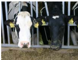
Table 2. Dodge County’s top commodities (Sales by dollar value, 2002)

Dodge County farmers produce a variety of products. Dairy, grain, cattle and calves, vegetables and poultry are the main commodities.