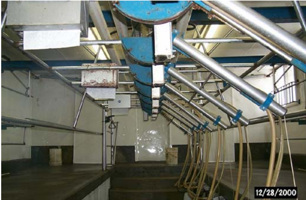
Figure 1. Retrofit parlors have proven to be a low cost way for Wisconsin dairy producers to adopt parlor technology into their operations. This parlor cost was under $34,000.

The transition from the tie stall barn milking system to a free stall housing and parlor milking system has been occurring on Minnesota and Wisconsin farms for several years. However, the adoption of milking parlors on smaller family dairy farms has been slow due to the large costs involved with building a traditional parlor and freestall setup.