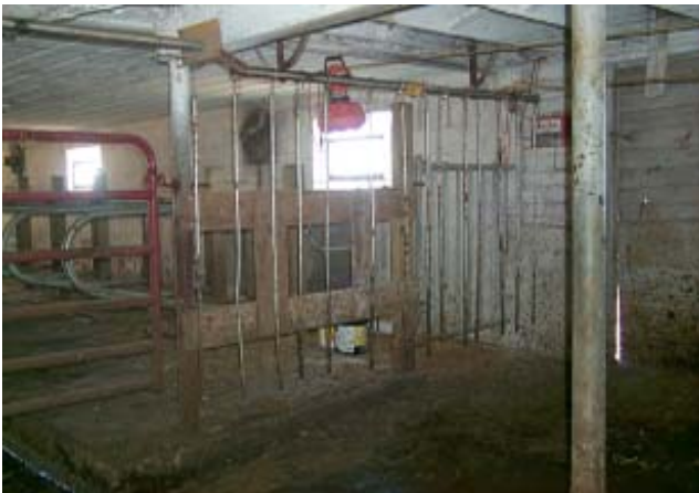
Figure 2. Innovative crowd gates have been developed by producers to allow the gates to work around king beam posts in stall barns.

Dairy producers have found significant cost advantages in building retrofit parlors in an existing stall barn. Cost savings of up to 25-50% have been realized when using the present milking system and the building shell that already exists in the stall barn. The center driveway in a stall barn works well for a holding area and other parts of the barn can be used for housing extra cows, maternity pens or a special needs area work area.